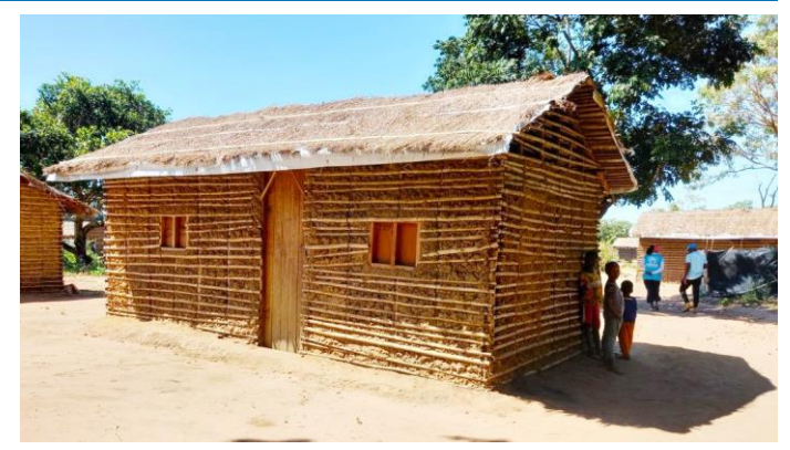
Shelters built by UNHCR and SI in Mueda.

In response displacement of 84,000 people following the attacks in Cabo Delgado's southern districts in June 2022, UNHCR and partner Association for Volunteers in International Service (AVSI) distributed complete NFIs kits for 500 displaced families in Montepuez. This included 1,000 blankets, 1,000 mats, 500 kitchen sets, 500 plastic sheets, 300 jerry cans, and 200 buckets.