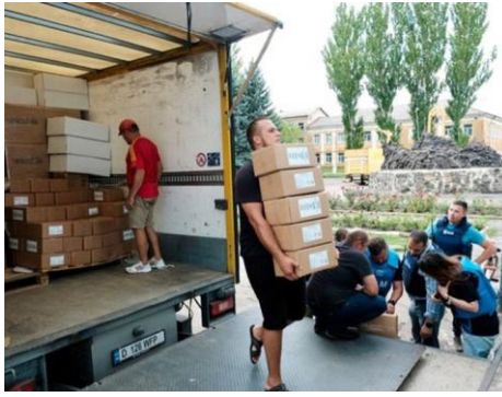
In coordination with other UN Agencies and NGOs, UNHCR is continuing to make all efforts to deliver much-needed assistance to the hardest-hit areas.