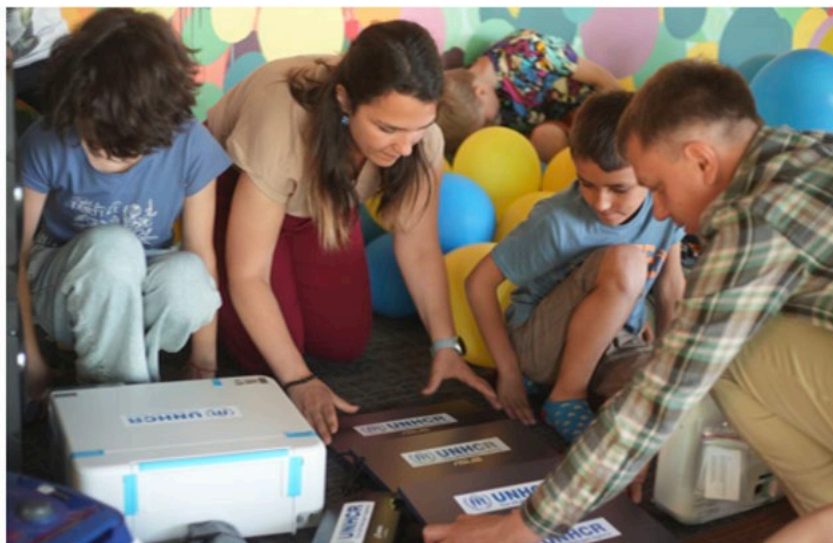
UNHCR delivered school equipment including laptops, printers and projectors to help foster a positive learning environment for refugee children and ensure continuous learning during the summer break.