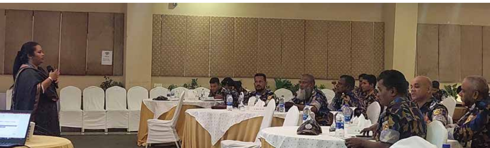
Skill sharing workshops help law enforcement agencies improve refugee protection and wellbeing in the camps.