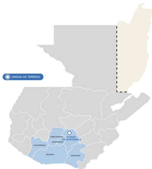
Refugees and asylum-seekers in the area

The Office assists cases with international protection needs at La Aurora International Airport and the Returnees Center. UNHCR provides protection and solutions response with the support of partners who provide shelter, legal and psychosocial advice, and durable solutions.