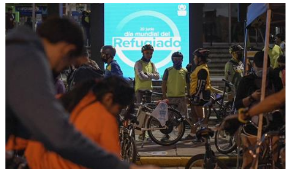
Bicycle tour for World Refugee Day.