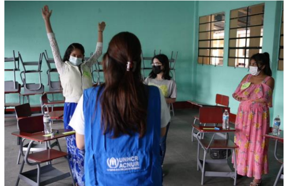
Participatory assessments with communities.