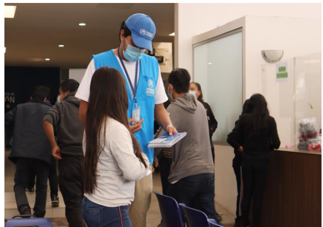
Identification of protection needs for returnees at the Guatemalan Air Force.