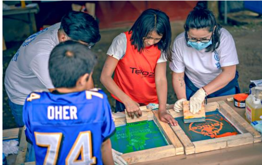
Peaceful coexistence fair in Villa Nueva.