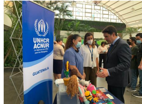
Entrepreneurship fair organized by the Municipality of Guatemala.