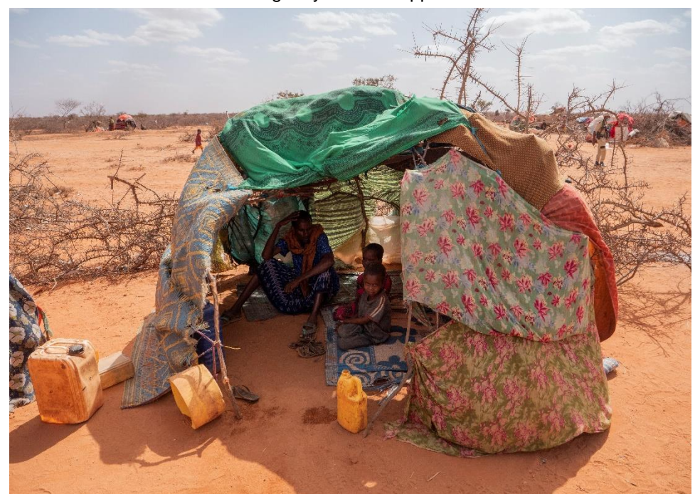
Thousands of people in Somalia have been forced to flee their homes in search of humanitarian assistance including food, shelter and safe drinking water.

UNHCR has been responding to the drought with lifesaving shelter and CRI assistance . Some 141,290 IDPs and host communities have received Core Relief Items (CRIs), which are comprised of basic household items, such as kitchen sets, blankets, and jerry cans, either in cash or in-kind. More than 33,000 IDPs have benefited from in-kind or monetized emergency shelter support.