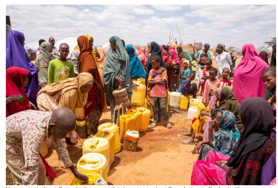
New arrivals from Somalia line up to fetch water tank at Dagahaley in Dadaab, Kenya.

UNHCR and partners have conducted vulnerability screenings to assess various