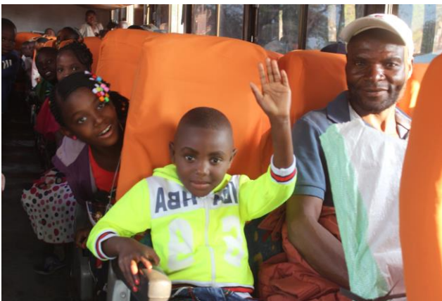
A Congolese voluntary repatriation convoy from Mantapala settlement to Pweto, DRC during the on-going Second Phase of the Congolese voluntary repatriation in Mantapala settlement