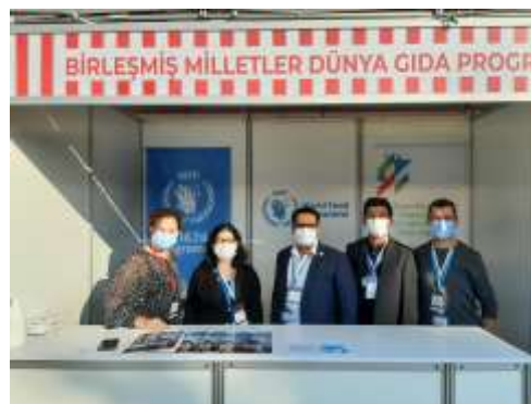
Photo caption: WFP's team in Izmir during Gastrofest Festival that took place in Izmir on 24 October.