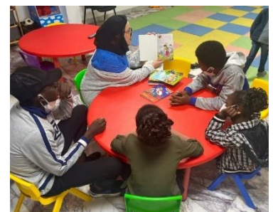
CFS activities at the CDC

Last week, staff at the Child Friendly Space in CDC provided recreational activities to 50 children, while many of their parents received other services at the CDC.