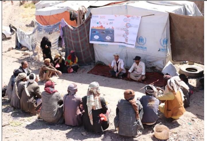
During the response to the IDP in Al-Khamis site, Bani Al-Harith district https://twitter.com/ygusswp/status/1583794233420369922