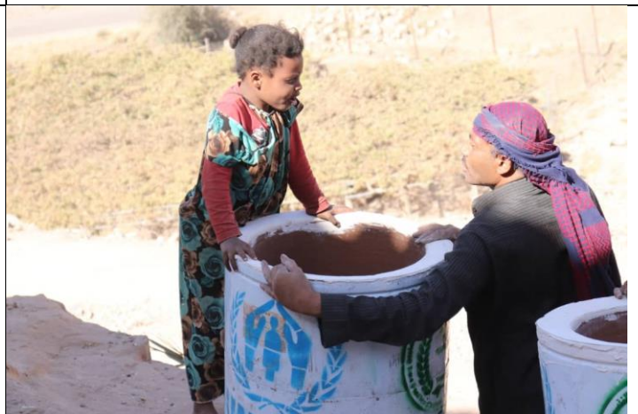
After the clay ovens distribution process in Sooq At- Thalouth and Bait Qahdan site in Bani Hushaysh district