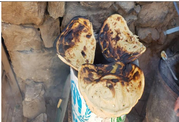
During the clay ovens distribution process in Sooq At-Thalouth and Bait Qahdan site in Bani Hushaysh district https://twitter.com/ygusswp/status/1586657206660997121