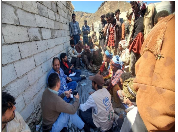
During OCHA representatives field visit to the site of Al-Azraqien in Hamdan district