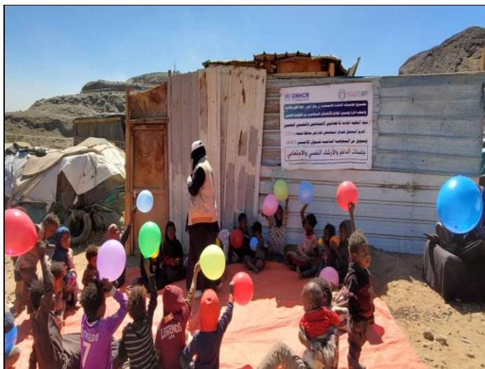
During providing protection services to the IDPs in Al-Azraqien in Hamdan district