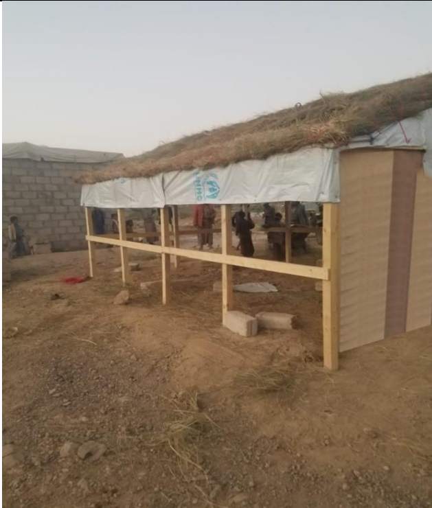
The Community space in Barza site in Bilad Ar-Rus district

https://twitter.com/ygusswp/status/1586657206660997121