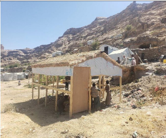
The Community space in Shibam Al-Ghirass site in Bani Hushaysh district