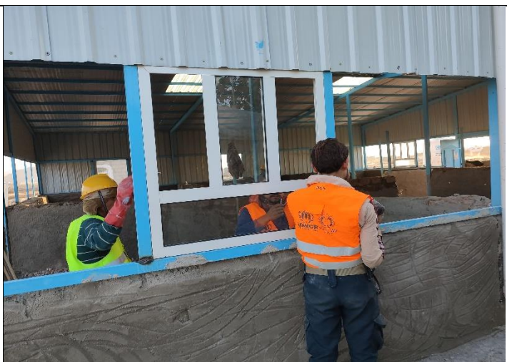
During the process of Ar-Raqqa school rehabilitation in Ar-Raqqa site in Hamdan district.