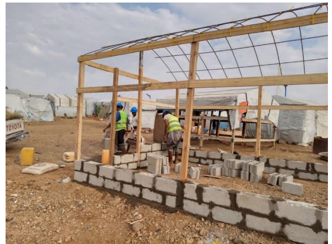
This photo describes installing nine community spaces in IDP sites in Harf Sufyan, Al-Qaflah, Al Madan, and Raydah districts in Amran governorate, CCCM team @YRCS.