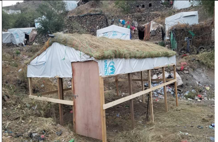
The Community space in Al-Mandhar site in Al-Haymah Al-Kharijiah district