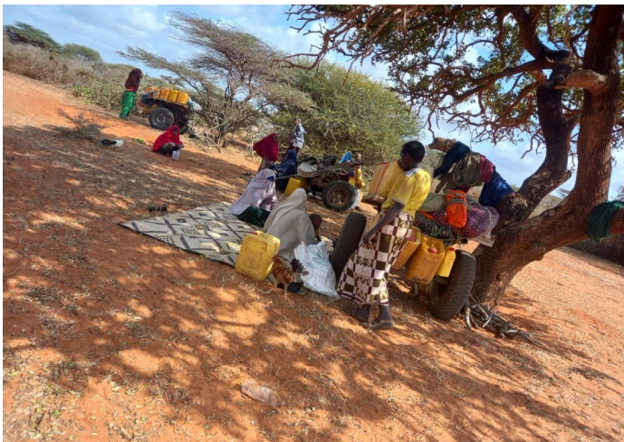
Figure 1: Drought-displaced arrivals staying under the trees