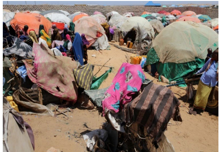
Figure 2: IDP sites receiving newly displaced people in

The PRMN is a UNHCR-led project which identifies and reports on displacements as well as protection risks and incidents underlying such population movements. On behalf of UNHCR and the Norwegian Refugee Council (NRC), 38 local partners in the field in Somalia (South Central regions, Puntland and Somaliland) undertake data gathering (primarily through interviews with affected communities and key informants) and monitoring at strategic locations.