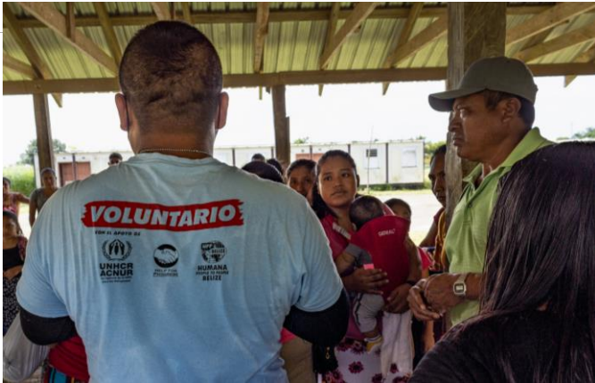
A volunteer offers advice on the Government of Belize Amnesty Program to asylum seekers in Trio Village.