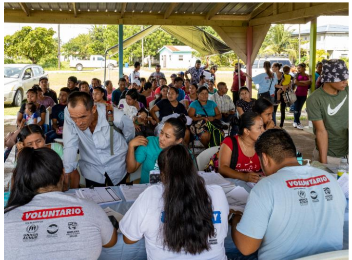
Volunteers from Humana People to People and Human Rights Commission of Belize, assist asylum seekers in Independence Village to complete their application forms.

On 17-18 September, UNHCR with the support of partner HUMANA People to People, brought the mobile Amnesty Support Clinic to Independence Village, Toledo and Santa Cruz, Stann Creek. In addition to assisting asylum seekers and other vulnerable groups with their application forms and photocopies, a total of 167 people received vouchers to cover the costs of medical examinations, photographs, lab tests, and translation of documents required for the amnesty application. UNHCR partner Human Rights Commission of Belize (HRCB) was also there to offer information and legal advice on the application requirements. The Government of Belize, through its Amnesty office in Dangriga, was also present during both days. In total, 210 persons received assistance at these clinics.