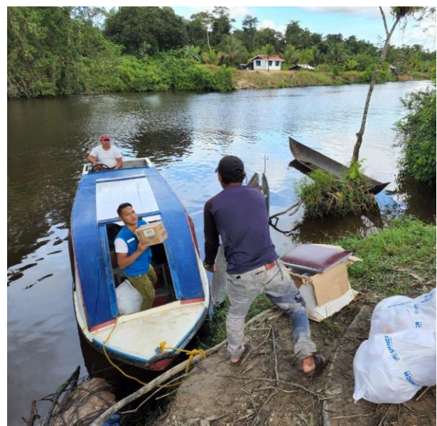
UNHCR accesses remote communities in Port Kaituma, (Region 1), to provide protection and humanitarian assistance to refugees and other vulnerable groups.

Gender-based Violence (GBV) continues to be a major concern, particularly for Venezuelan refugees and migrants – mainly women – who have engaged in survival sex and are at risk of human trafficking . Child Protection concerns are also consistently present.