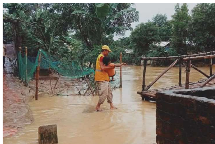
Rohingya emergency response volunteers help their community to get to safety during some minor flooding in the camps caused by heavy monsoon rains