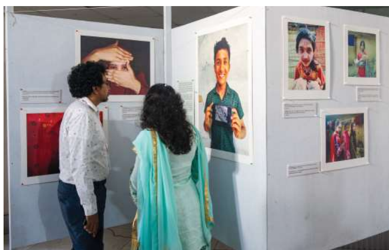
The exhibit "I am Rohingya" showcasing the work of 10 Rohingya photographers living in the camps in Bangladesh opened its doors in Cox's Bazar.