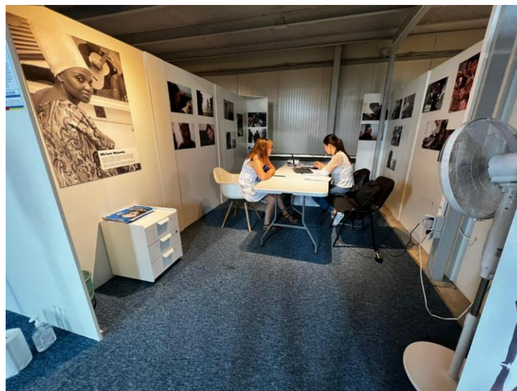
Ateliere fara Frontiere (AFF), providing free employment assistance services at RomExpo in the newly decorated space shared by ANOFM and AFF.

To strengthen information management systems and to better inform the refugee response in Romania, UNHCR and Department of Emergency Situation (DSU) organized a RefData Meet Up in Bucharest on 22 September. Thirty-six participants from relevant authorities, municipalities and humanitarian actors engaged in the discussions and affirmed their support to further improve the information management system in Romania, including regarding population figures, needs assessments and population reached to enhance the evidence base for programming and coordination.