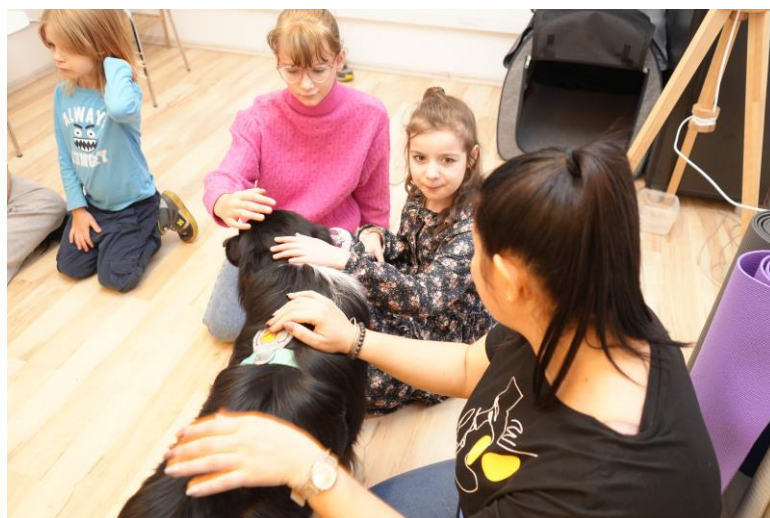
Traumatized by the war back home, refugees from Ukraine in Hungary are finding helpful ways to maintain their mental health. UNHCR partner Next Step offers dog therapy sessions to refugee kids in the BudapestHelps! Community Center, jointly run by Budapest Municipality, IOM and UNHCR.

1 Multi-country office in Budapest, also supporting national offices in the Czech Republic, Slovakia and Slovenia.