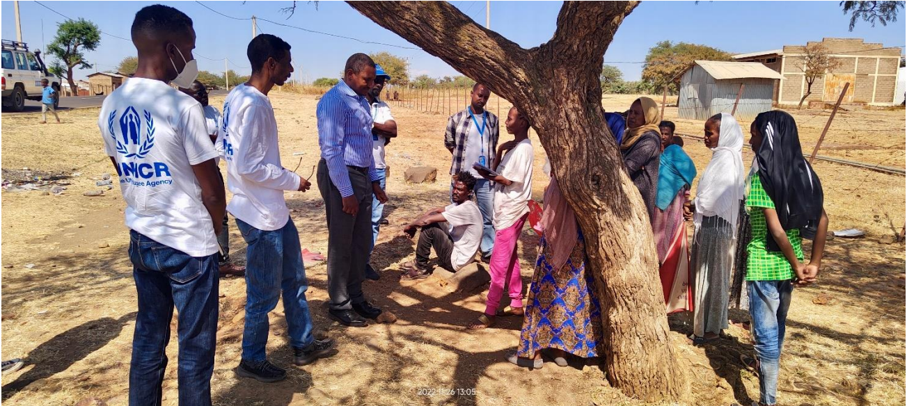
UNHCR Representative in Ethiopia speaks with internally displaced people near Mai Tsebri in the Tigray region of Ethiopia. The country has an estimated 4.7 million internally displaced people (IDPs), including nearly 2 million IDP returnees, largely resulting from drought, the conflict in northern Ethiopia and localized conflicts in different parts of the country.