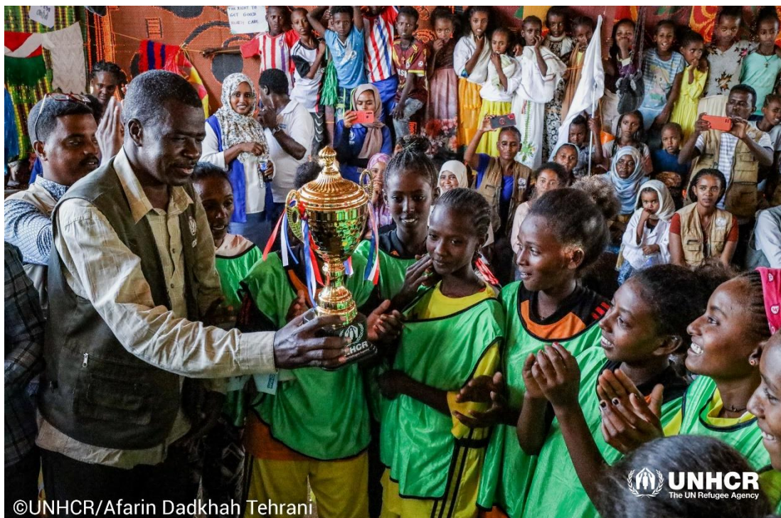
To celebrate World Children's Day on 20 November, Ethiopian refugee children participated in football and volleyball games in Tunaydbah camp, Eastern Sudan. Children could also enjoy one of the child friendly spaces where several performances and activities were carried out.

The number of new arrivals from Ethiopia in November remained low; in November, a total of 99 new arrivals from Ethiopia were recorded crossing into Sudan via Gallabat, Hamdayet and Taya border entry points.