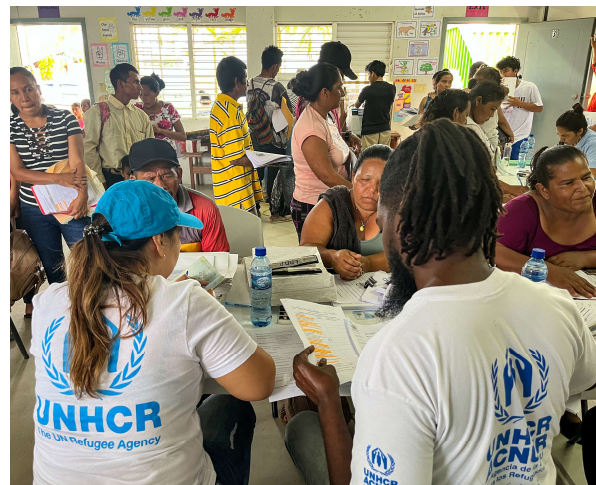
UNHCR staff assisting asylum seekers and other vulnerable groups to complete application forms in English for the Government of Belize Amnesty exercise.

UNHCR and other UN agencies officially welcomed, the Government of Belize announcement to extend the Amnesty application period for three additional months. The deadline, which was previously set for 30 November 2022, was extended until 28 February 2023. During the previous months, UNHCR in collaboration with UNICEF and IOM, advocated for this extension with the relevant authorities, aiming to allow agencies and government partners to reach and support prospective applicants who have not yet been able to complete their applications.