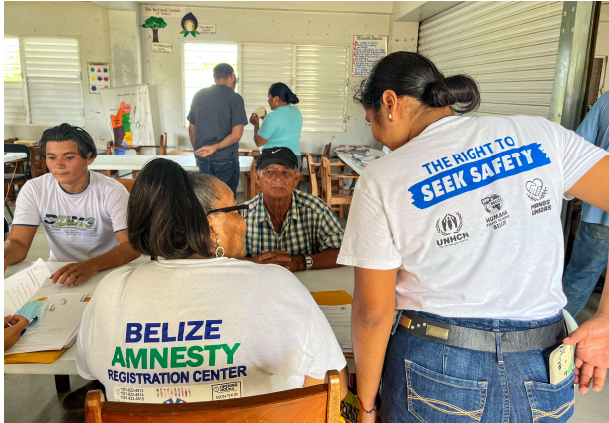
A volunteer from UNHCR partner Humana speaks with an official from the Dangriga Belize Amnesty Registration Centre, during an Amnesty Mobile Clinic in the Santa Cruz Village.