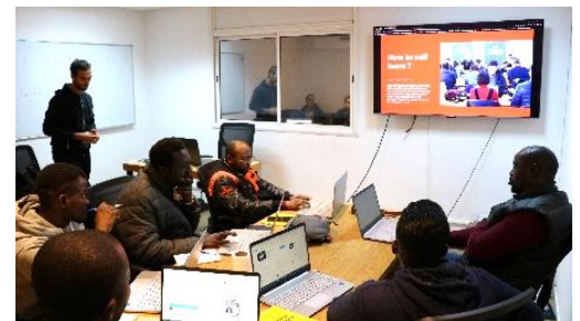
Refugees taking part in a coding class in GoMyCode coworking space, November 2022.

UNHCR partnered with the Tunisian start-up ‘GoMyCode’ to launch web development and coding courses aimed at building skills and capacities for refugees, in line with UNHCR’s digital inclusion strategy. Participants will benefit from trainings in the development of both front-end and back-end elements of web applications and provided with tools to design web applications and websites.