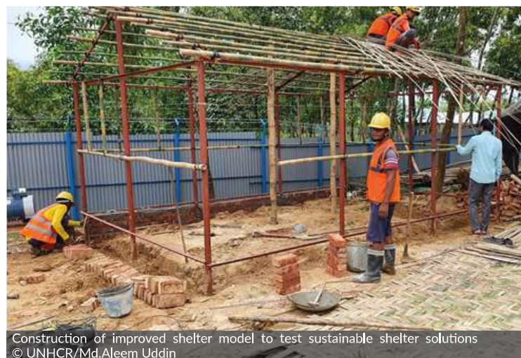
Construction of improved shelter model to test sustainable shelter solutions

UNHCR and partners are working together for adequate and dignified living space for refugees within the approved guidelines. UNHCR promotes effective and sustainable shelter solutions through the efficient use of space and sustainable use of materials. UNHCR continues to reinforce existing temporary shelters with steel footings and treated bamboos. In 2022 new designs continue to be tested and UNHCR continues to advocate for approval of large-scale rollout of these improved designs.