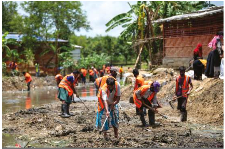
Refugee WASH volunteers help clean during a Dengue prevention campaign

UNHCR and partners supply safe water to refugees in 14 camps through piped water networks and tube wells. Trained refugee volunteers conduct regular operations and maintenance of the systems. To monitor water supply, UNHCR and partners installed real time remote monitoring system devices at selected water networks in Ukhiya and Teknaf. Water quality monitoring at water points and household levels is also conducted on a regular basis. Due to annual water shortages in Teknaf, UNHCR has several interventions to supplement existing systems. Shalbagan Reservoir, designed with the support of the Dutch Surge Support facility, was completed in September 2021 by the Department of Public Health Engineering and Asian Development Bank, to enable storage of rain during the monsoon to support continuous water supply during dry periods. In 2021, a multi-year groundwater project began, funded by the Government of Japan, to address the water shortages. The project will contribute to the drinking water supply while advocacy to mobilize and develop further surface water resource in line with national policy. The investigation boreholes have been drilled and data analysis is going on.