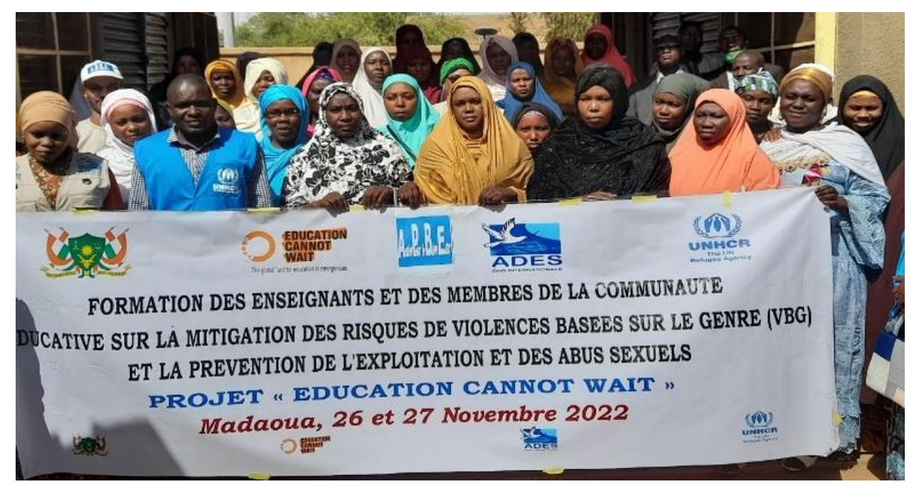
Participants in the training on GBV prevention and PSEA

At the end of 2022, a total of 94 teachers from 13 primary and secondary schools in the department of Madaoua were trained on the mitigation of risks of Gender Based Violence (GBV) and on Prevention of Sexual Exploitation and abuse (PSEA) , learning about the code of conduct, the management of survivors, the role of community structures in the management of GBV cases: Finally, the reporting system was evaluated and updated and GBV and PEAS focal points were appointed in some selected schools.