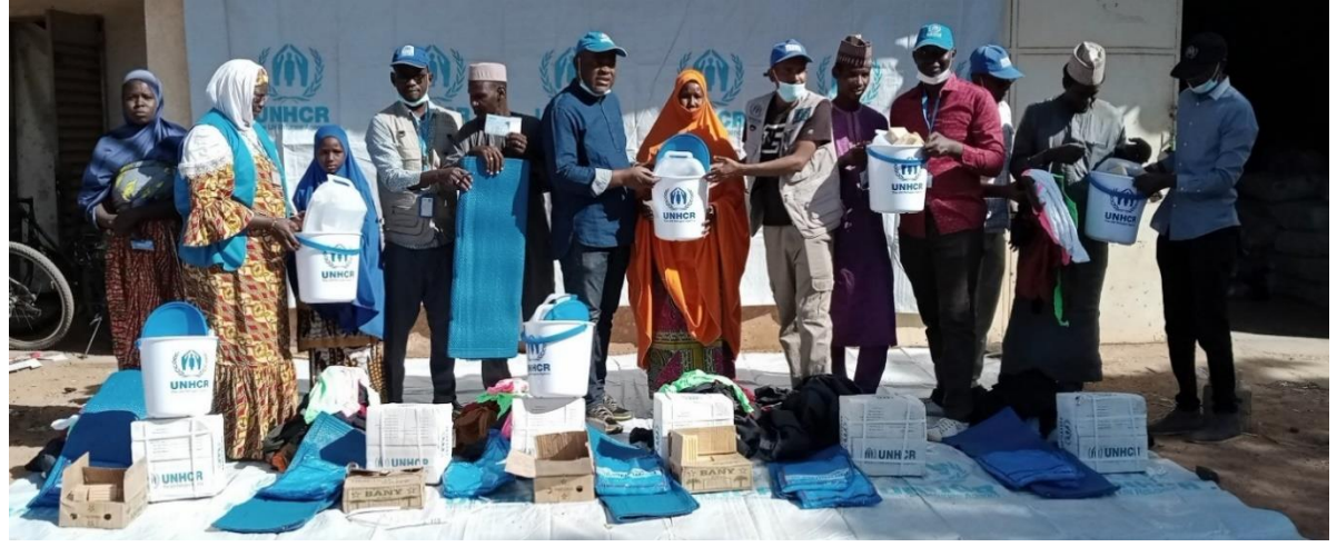
Distribution of Non-Food Items in Tera to newly arrived asylum seekers from Burkina Faso

The municipality of Tera and the Directorate of Civil Status , with the support of UNHCR and its partners, are continuing the initial registration of asylum seekers from Burkina Faso , who have arrived in Tera since early November. As of 31 December 2022, a total of 1,711 households (9,449 individuals) have been registered. UNHCR, through its partner Action Pour le Bien-Être (APBE), distributed household items and clothing to the newly arrived persons from Burkina Faso.