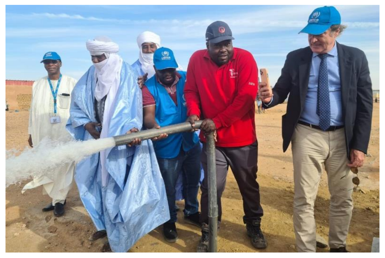
UNHCR Representative and members of the local authorities of Agadez during the official ceremony of the handover of the water extension system

On 6 December, an official ceremony took place to inaugurate a water extension, which connects the water system of Agadez to the humanitarian center and neighbouring communities, to guarantee that refugees at the Humanitarian Center and Nigeriens have access to drinking water.