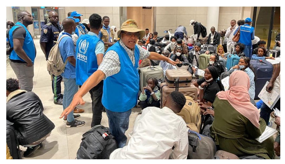
On 1 November, UNHCR Niger received 174 asylum seekers, who have been evacuated from Libya via ETM to Niger. UNHCR

This number comprises of 3,526 persons, who have been evacuated from Libya through the ETM and 1,570 refugees that have been registered in the national asylum system in Niger.