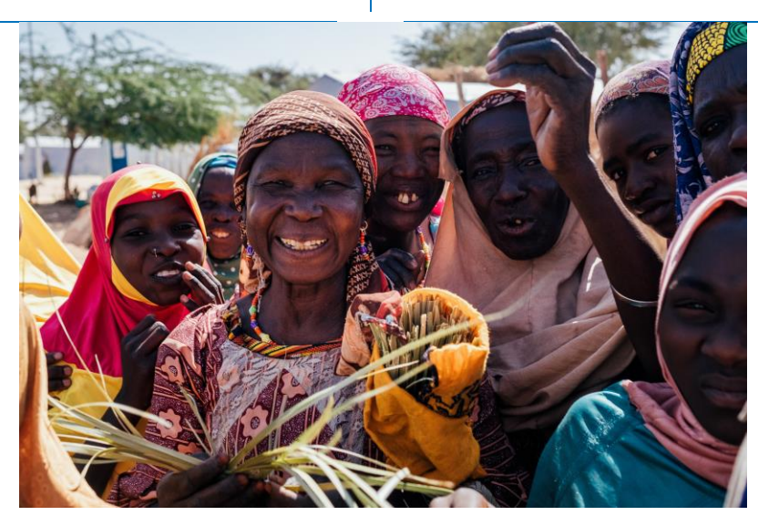
Nigerian women at the 'Village of Opportunity' of Chadakori