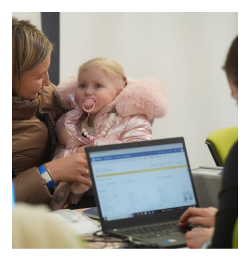
Mother and daughter undergoing registration at Bottova Centre in Bratislava.