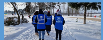
Joint monitoring visit by CNRR and UNHCR at Siret border crossing point with Ukraine.

UNHCR have been working with Romanian national NGO - Consiliul National Romanien pentru Refugiati (CNRR) since 1990's. In 2023, CNRR's will continue to support refugees from Ukraine with i) reception support and information provision at border and reception centres; ii) legal assistance and counselling; iii) inclusion and integration support to facilitate access to rights and services including for children; and iv) development of institutional practices through advocacy and capacity building initiatives. CNRR is operating in nine counties across Romania.