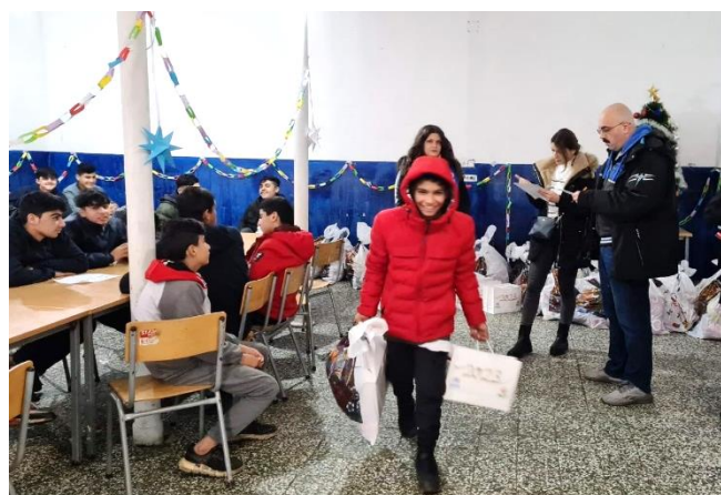
Distribution of New Year's parcels to UASC accommodated in Šid RTC, @HCIT, January 2023

On 16 January, HCIT distributed New Year's gifts to 45 children (UASC and children traveling with families) accommodated in Šid RTC. The gift bags contained toys, cosy blankets and sweatshirts, candies and sweets and school supplies.