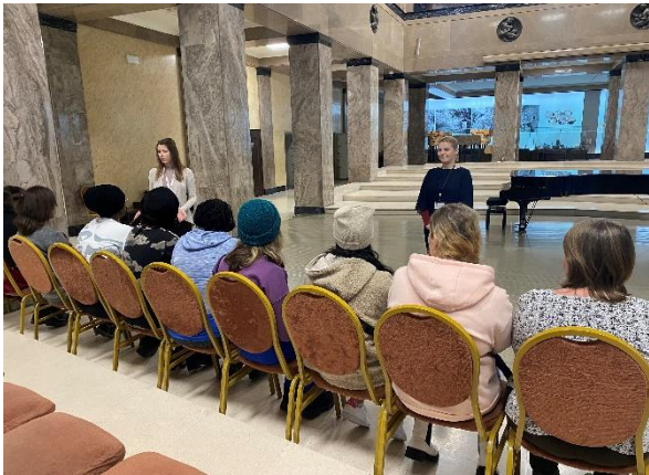
Refugee women visiting the National Museum ©DRC, January 2023