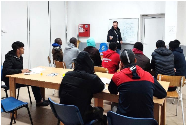
Serbian lessons in Sjenica Asylum Centre, ©Sigma plus, January 2023

Activities of UNHCR and its partners aim at ensuring that refugees, asylum-seekers, internally displaced persons (IDPs) and persons at risk of statelessness benefit from an improved and systematically implemented legal framework and can thus access rights in line with the international standards, and that persons in need of international protection have access to territory and asylum procedure and receive protection and assistance in safe reception conditions.