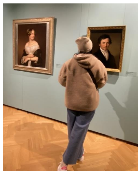
Women from Krnjača Asylum Centre visiting the National Museum in Belgrade, @DRC, January 2023

Inclusion of refugees, asylum-seekers, IDPs and persons at risk of statelessness in community activities promotes inclusion and peaceful coexistence. UNHCR focuses on promoting their human capital, and on linking them with the local authorities, schools, youth, cultural centres and municipalities, and on supporting joint projects.