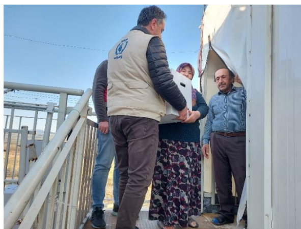
Photo Caption: WFP staff distributing food packages to refugees and IDPs in Cevdetiye camp, Türkiye.