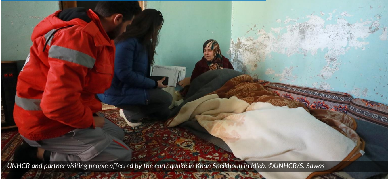
UNHCR and partner visiting people affected by the earthquake in Khan Sheikhoun in Idlib.

15 February 2023 / Updated as of 16:00 hrs