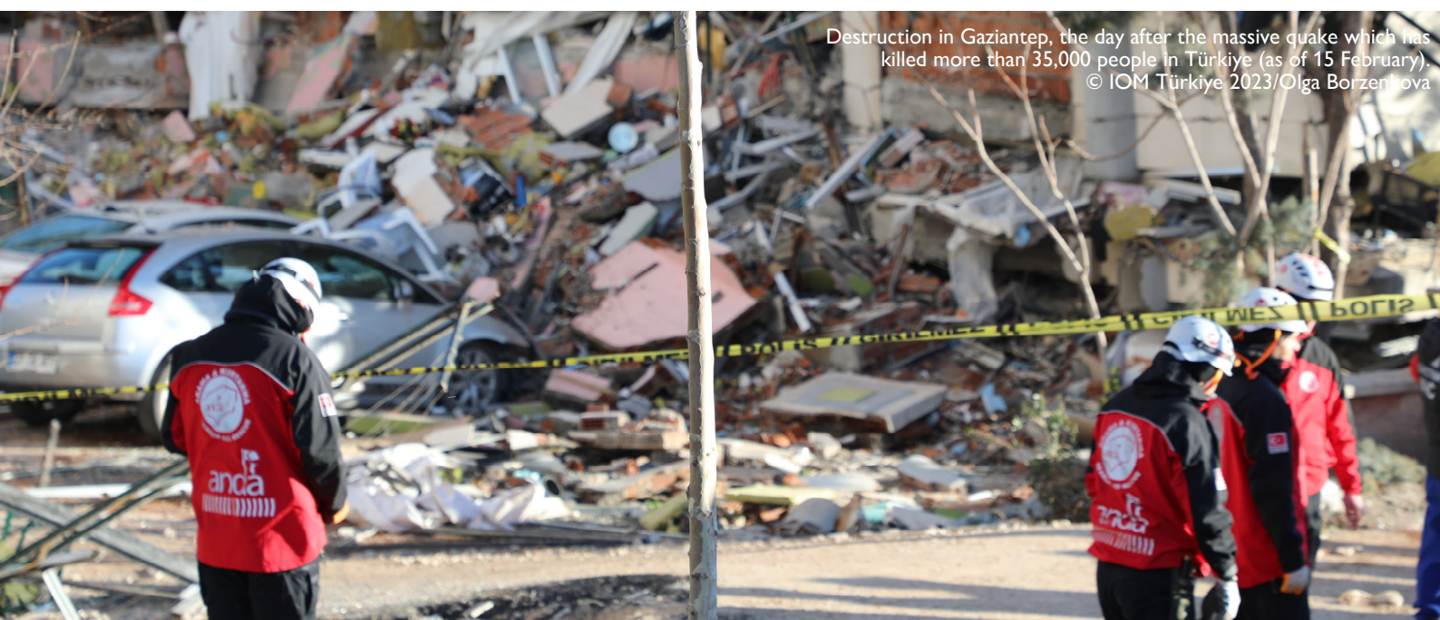
Destruction in Gaziantep, the day after the massive quake which has killed more than 35,000 people in Türkiye (as of 15 February).