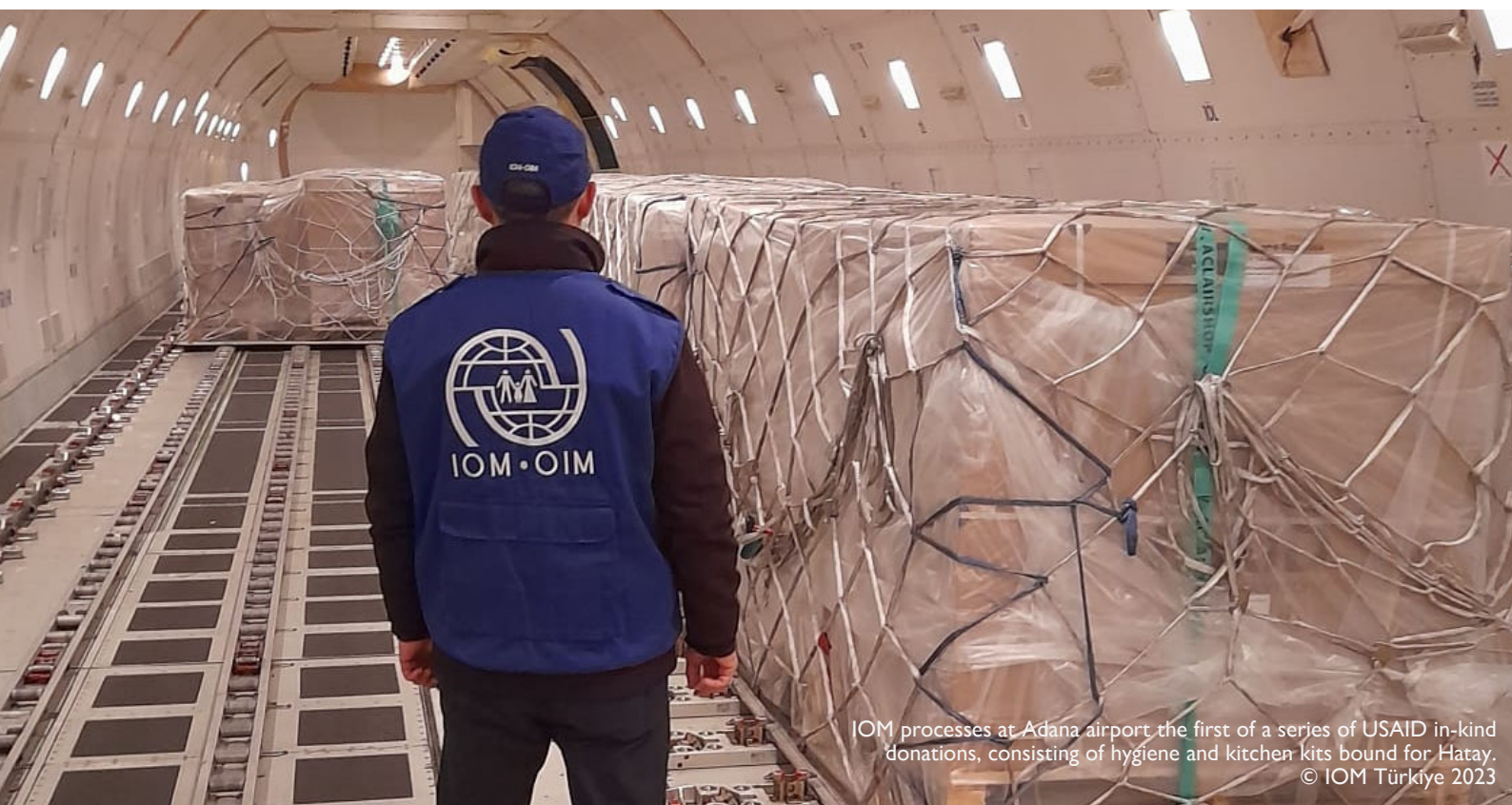
IOM processes at Adana airport the first of a series of USAID in-kind donations, consisting of hygiene and kitchen kits bound for Hatay.

IOM is a key member of interagency coordination efforts in Türkiye related to the crisis. Activities will be coordinated alongside actors on the ground to minimize the risk of duplication. IOM will work with a network of Turkish NGO partners, to ensure those most in need are reached with services, including in rural and remote areas.