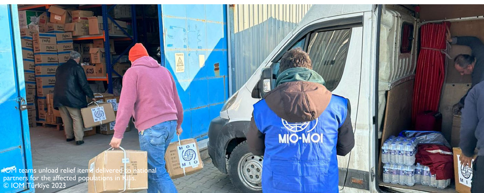
IOM teams unload relief items delivered to national partners for the affected populations in Kilis.