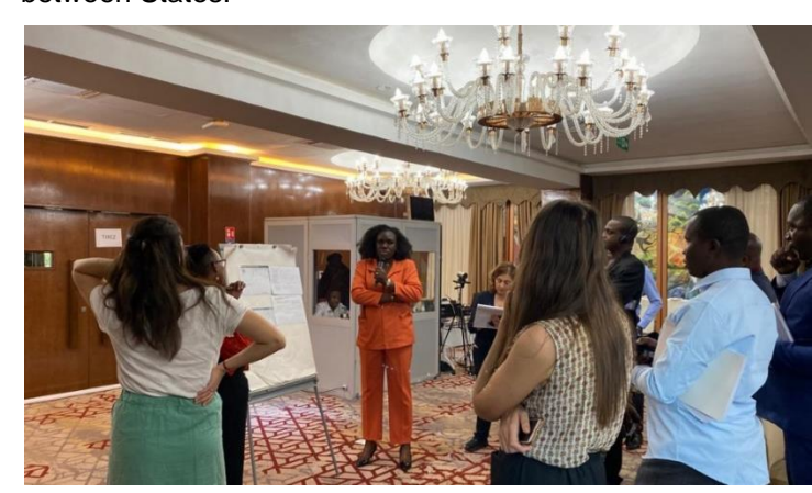
In Dakar, UNHCR colleagues based across seven Operations participated in a training workshop on trafficking in persons.

In the context of the Euro-African Dialogue on migration, asylum and development (Rabat Process), ministers and high-level representatives of the partner countries and organisations met in Cadiz, Spain , for the 6<sup>th</sup> Ministerial to adopt the Dialogue's new multi-annual action plan, promoting, inter alia, responsibility-sharing and cooperation between States.