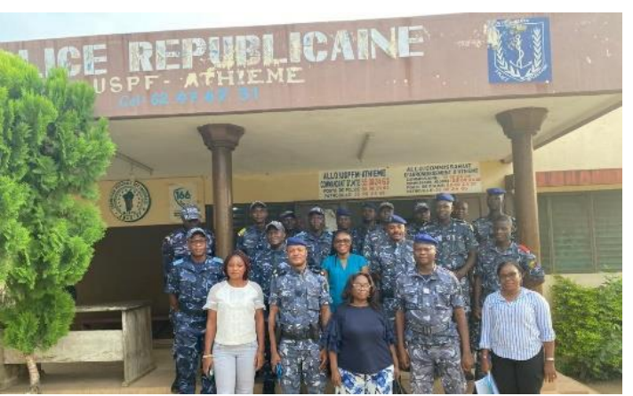
The national asylum authority in Benin facilitated a training for police forces deployed in border entry points.

Effective and timely identification of people on the move with protection needs is essential to offer alternatives to risky journeys through referrals to protection services. Capacity-building and sharing activities across the region reached over 260 first-contact entry officials, resulting in the referral of 1,800 persons identified along key routes.