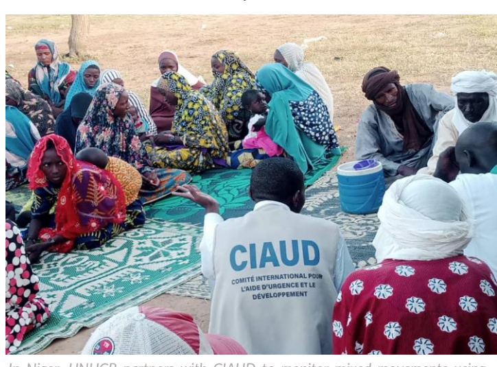
In Niger, UNHCR partners with CIAUD to monitor mixed movements using community-based monitors.

Increasingly affected by insecurity and forced displacement with the spillover of the Sahel situation, Bobo-Dioulasso is a long-standing transit hub for mixed movements between Burkina Faso and Cote d'Ivoire. In Chad, 240 persons on the move were referred to protection services by Red Cross volunteers. In Gabon, a training of trainers was facilitated by the Central African Police Chiefs' Committee (CAPCCO), the International Organization for Migration (IOM), UNHCR, the UN Office on Drugs and Crime (UNODC) and GIZ, with a focus on protection-sensitive entry measures in a context of mixed flows. A roundtable was also organised by UNHCR and UNODC to finalise and endorse new Standard Operating Procedures (SOPs) and a screening form to be used by immigration services to support the identification and referral of people on the move with protection needs. Along the route connecting Gabon to the Democratic Republic of the Congo (DRC), UNHCR and the National Commission for Refugees met with local defense and security forces to raise