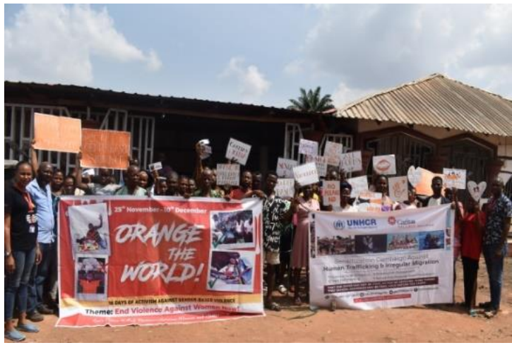
In Nigeria, a community dialogue session was facilitated on gender-based violence and trafficking in persons Edo State, a key region of origin of trafficking, including to Europe.

In Chad, community-based Red Cross volunteers reached 30,000 persons on the move and in areas of transit. In Cross River State, Nigeria, the National Agency for the Prohibition of Trafficking (NAPTIP), the National Commission for Refugees Migrants And Internally Displaced Persons (NCFRMI), UNHCR, Caritas, Catholic Relief Services (CRS) and the Nigerian Red Cross Society facilitated a dialogue with refugees and host communities in Bakoko on gender-based violence, trafficking in persons and referral pathways to protection services. Reaching over 2,000 persons, a similar session was held for secondary school students under the lead of UNHCR, in collaboration with NAPTIP and Caritas. On the occasion of the 16 Days of Activism Against Gender Based Violence, some 20 Anti-Human Trafficking clubs facilitated public debates in Cross River and Edo States, highlighting the linkages between gender-based violence and trafficking in persons.