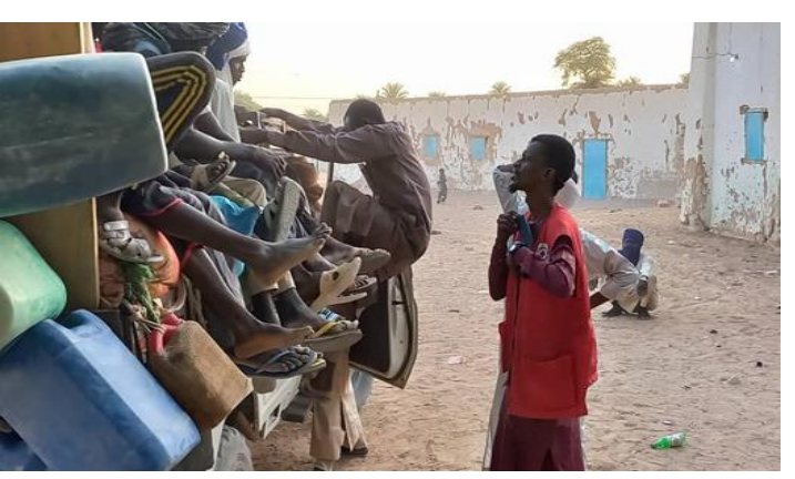
In Chad, community-based Red Cross volunteers reached 30,000 persons on the move and in areas of transit.

By providing access to accurate and up-to-date information on protection risks en route and alternatives to risky onward movements, communication with communities allows persons on the move to make informed