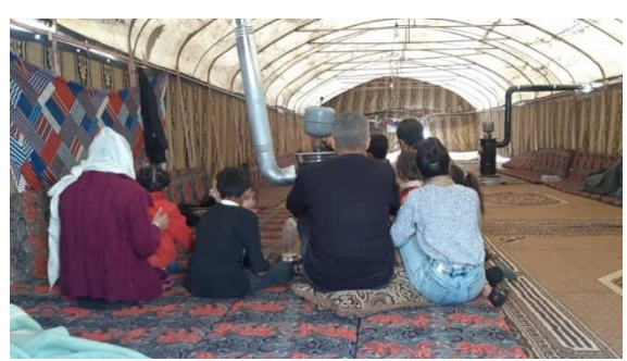
Large-sized tents accommodating affected families in Kobane.

The 10 large-sized tents UNHCR dispatched from Qamishli (Al-Hasakeh Governorate) on 14 February have reached their final destination, Kobane/Ayn Al-Arab, Aleppo Governorate. UNHCR and partners have installed two tents in hospital yards and the remaining eight in public parks and streets. Each tent aims at accommodating eight families, reaching a total of 80 families (400 individuals) who had to leave their homes due to the earthquake of 6 February.