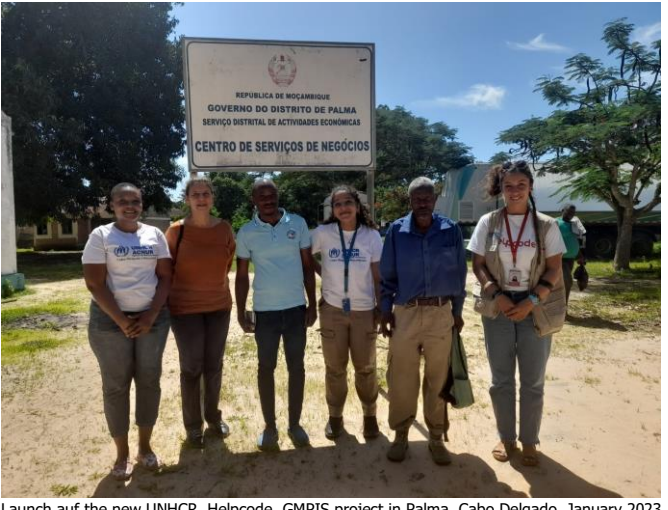
Launch auf the new UNHCR, Helpcode, GMPIS project in Palma, Cabo Delgado, January 2023.

148 Protection Focal Points working with displaced and host communities, disseminating protection messages and referring vulnerable cases for services and assistance