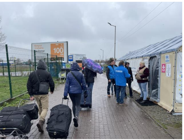
UNHCR staff at Medyka Border Crossing Point.