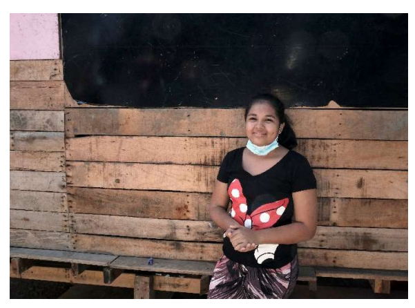
Together with her mum and sister, this young girl from Nicaragua sought refuge in Panama where they are now trying to rebuild their life selling food and bread.