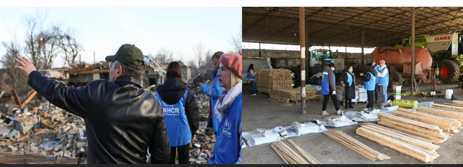
In Velyka Vilshanytsya, Lvivska oblast, UNHCR and local authorities were on the ground immediately after the missile strike on 9 March 2023 to assess the damages of residential homes. Emergency shelter kits were provided to support impacted families through local NGO partner Rokada.