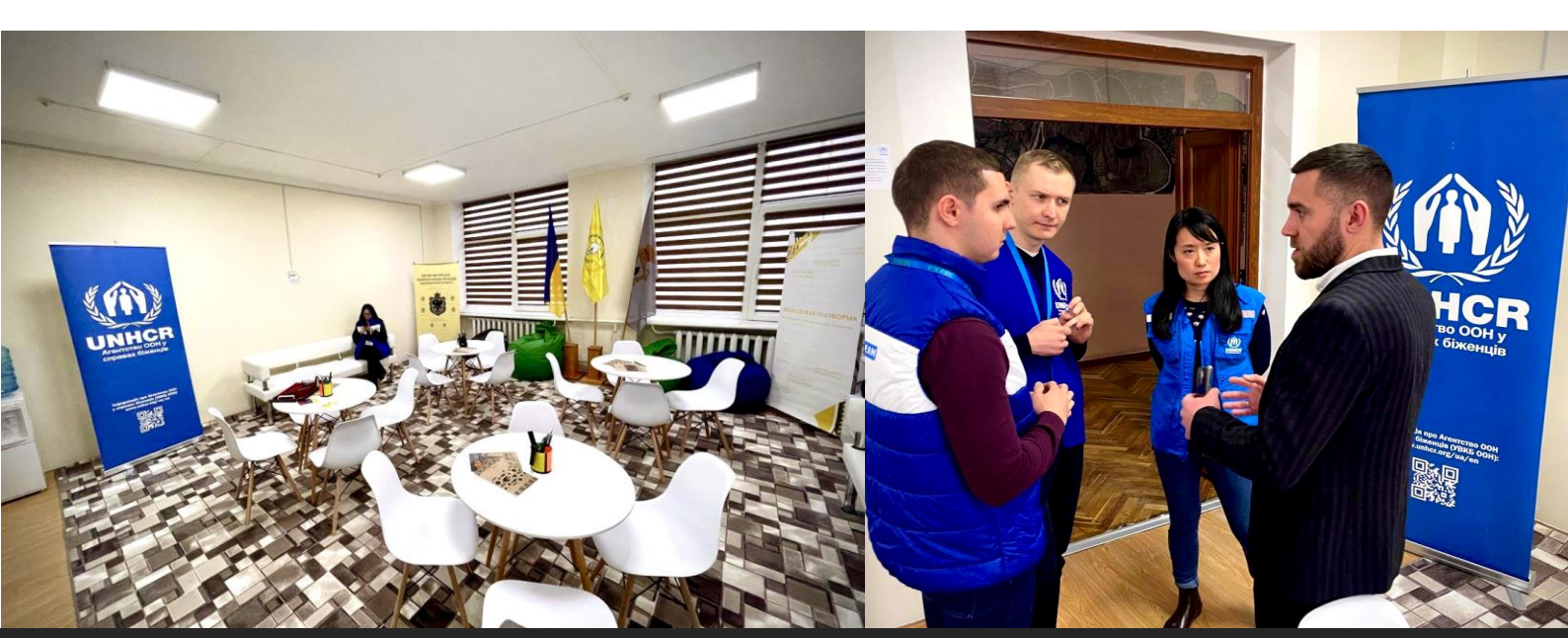
On 7 March, UNHCR joined the opening of a youth centre supported as part of a community project under CCCM, in the city of Tyachiv in Zakarpatska oblast. The centre will be an important place to promote the integration of IDP youth into the local community as well as to give the opportunity to find jobs, receive training or undertake requalification courses.