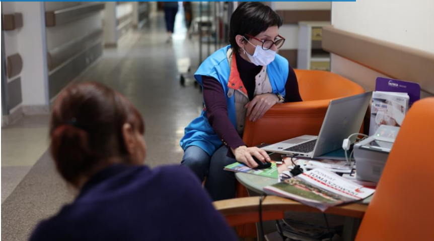
A UNHCR mobile team enrolls a refugee in the cash assistance programme at a hospital in Lublin. UNHCR mobile teams are reaching out to refugees in several regions of Poland, to gather information about their situation and provide services and aid.