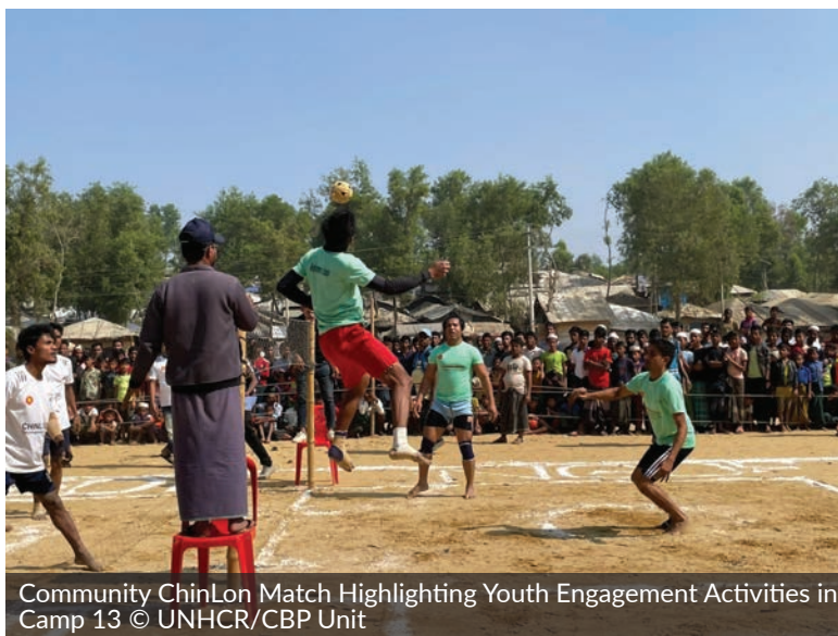
Community ChinLon Match Highlighting Youth Engagement Activities in Camp 13

The Information Service Centres (ISCs) are facilities where refugees can go to receive information about humanitarian services and to share feedback and concerns. ISC staff and volunteers conduct outreach sessions and follow up with vulnerable persons to access services. UNHCR and partners work with refugees to create content on topics of concern to the community, including peaceful coexistence, access to services, and disaster preparedness. These messages are disseminated using audio messages and facilitated listening sessions. UNHCR also operates an Interactive Voice Response system to send pre-recorded audio messages as phone calls in Rohingya language, reaching over 70,000 people in the fourth quarter of 2022.