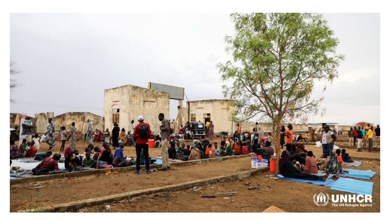
UNHCR has set up one transit center which has been s operational in Renk, and the second one is underway. UNHCR Transit Centre, Renk, Upper Nile, April 27, 2023