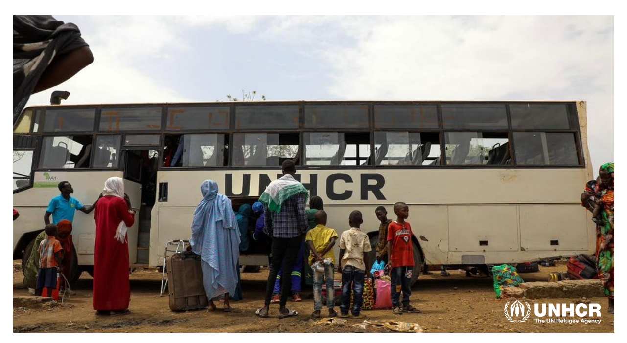
UNHCR bus is travelling between the Joda Border Crossing and the UNHCR Transit centre transporting the most vulnerable from the border. Services at the border are very limited and many have been stuck for days. At the transit center, UNHCR is providing water, core relief items, and tailored support to the most vulnerable.