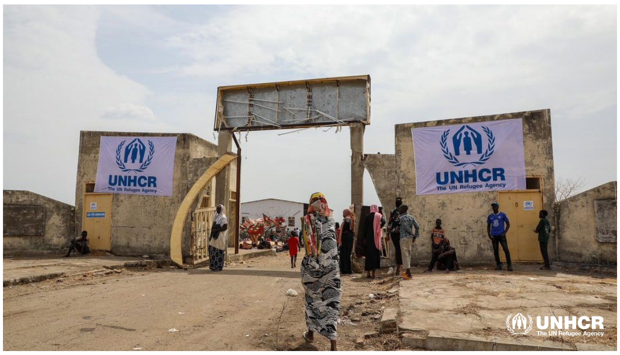
UNHCR Transit Centre in Renk, close to the Joda border crossing where the majority of those fleeing violence in Sudan have crossed into South Sudan. Services at the border are very limited and priority is to facilitate onward movement away from the border. At the transit center, UNHCR is providing basic services, water, core-relief items, and food through World Food Programme/WFP.