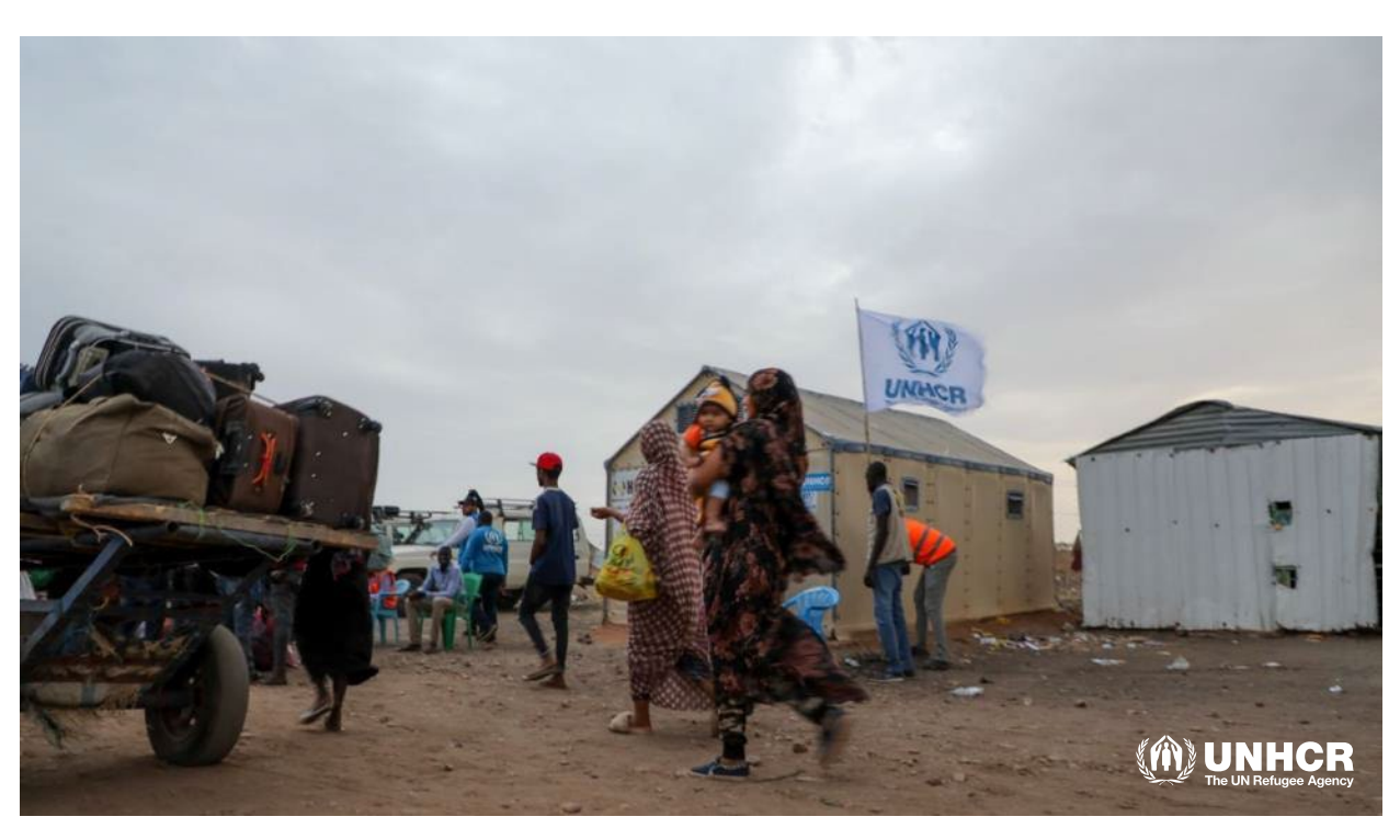
A dire situation at the border Renk. Over 11,000 approached UNHCR and partner for assistance / registration since 15 April, while waves of families and individuals crossed the border on motor vehicles, donkey carts or on foot as pedestrians.

Refugees will be identified and depending on their circumstances will be transported to suitable existing camps or be allowed to settle in communities and towns. UNHCR has noted that in addition to Sudanese asking for asylum, a number of Ethiopian, Eritrean and Somali refugees who had been living in Khartoum are also arriving.