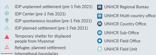
Estimated internal displacement within Myanmar Pre+Post 1 February 2021 (rounded to the nearest hundred)

The boundaries and names shown and the designations used on this map do not imply official endorsement or acceptance by the United Nations