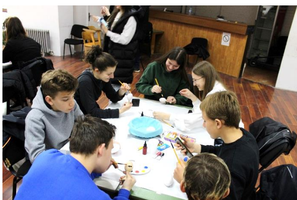
Easter eggs painting in Vranje, ©Indigo, 11 April 2023

On 11 April, Ukrainian refugee children from Vranje AC attended an activity for painting Easter Eggs which was organized by Indigo and Youth Office in Vranje.