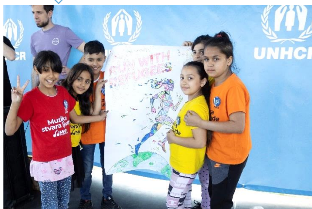
Children from vulnerable groups who are part of the Music Art Project (MAP) performed at UNHCR music stage in the Belgrade Marathon, @UNHCR, 23 April 2023