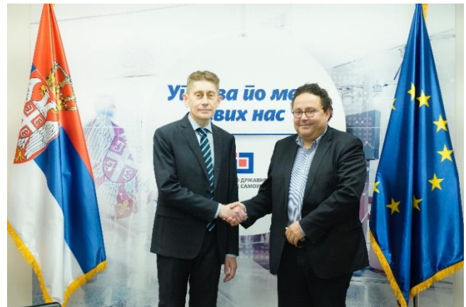
UNHCR Representative Soufiane Adjali and Minister of Public Administration and Local Self-Government Aleksandar Martinović, @MPALSG, 26 April 2023

Over the past decade, Serbia has progressed significantly in statelessness reduction and prevention. Having changed the legislation, the authorities next focused on the harmonization of practice of relevant actors at the local level, resulting in reduction of the number of persons at risk of statelessness from tens of thousands in 2010 to less than 2,000 today.