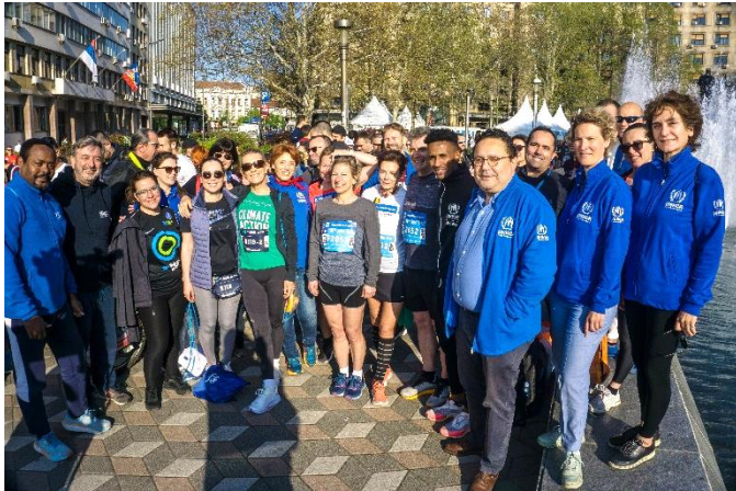
#WithRefugees team took part in the 36 th annual Belgrade Marathon, 23 April 2023