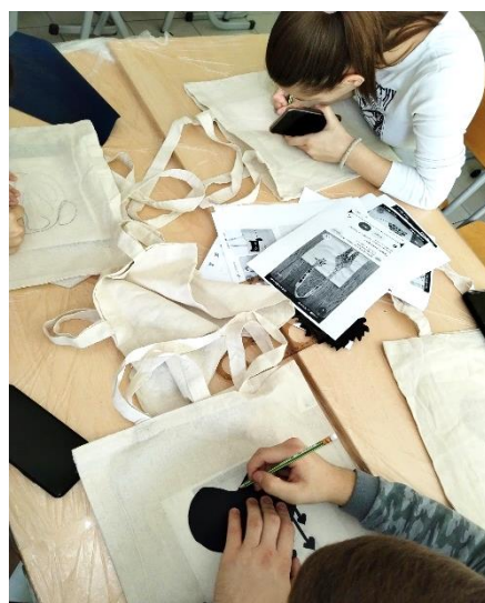
Creative workshops with refugee and local children at the Technical School in Obrenovac (Art Unites), April 2023

On 28 April, 11 boys from Afghanistan, residents of AC Obrenovac joined 21 pupils of Technical School Obrenovac in a joint cleaning/greening of the school. This activity was organized in the framework of a tripartite MoU among CRPC, UNHCR, and the Technical School.