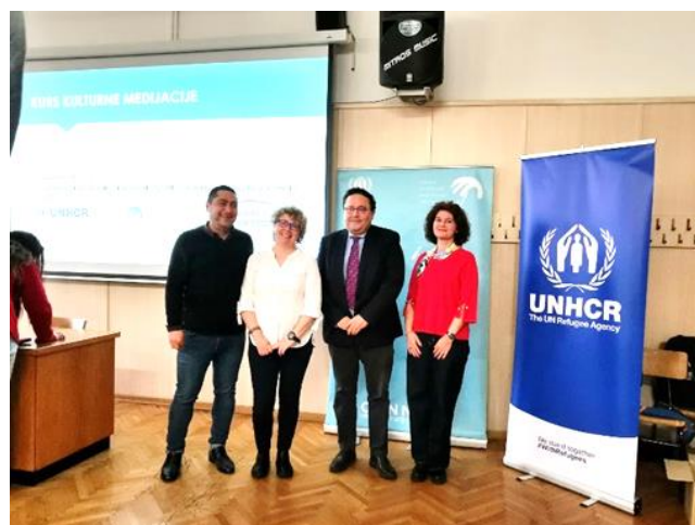
Faculty of Philology in Belgrade, CRPC and UNHCR kickstarted the 2023 Course in Cultural Mediation in the Faculty, @CRPC, 8 April 2023

In April, DRC organised one return-related meeting in