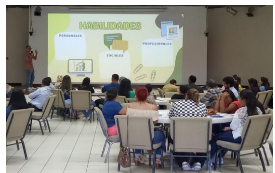
People with and for whom UNHCR works attend basic training at Fundación Omar Dengo/ Emily Robles/2023