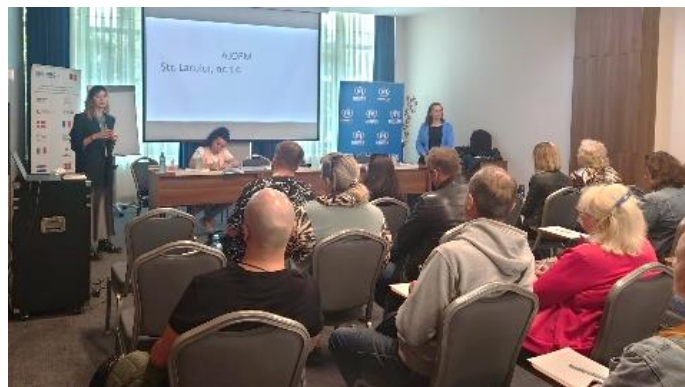
Awareness session held on 18 May in Constanța on conditions for registration in the new government assistance programme with participation of 80 refugees from Ukraine.

UNHCR and partners continue providing individual career counselling and Romanian language courses to refugee job seekers. In 2023, 834 refugees have been provided with career counselling and relevant information, and 321 have been enrolled in language courses. More than 100 refugees have secured employment through support of UNHCR and partners in 2023 ensuring livelihoods for over 300 family members.