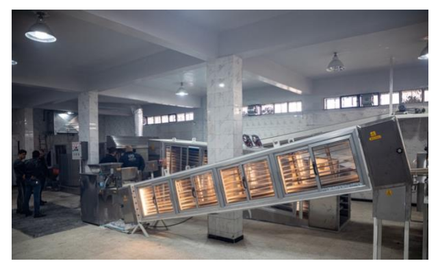
created job opportunities for many returnees.

UNHCR provides support to facilities/services which have a positive social and economic impact on communities, job creation, capacity-building and employability while addressing protection The repair of a bakery in Tal Hedia village, Aleppo Governorate, issues and benefitting the wider economy.