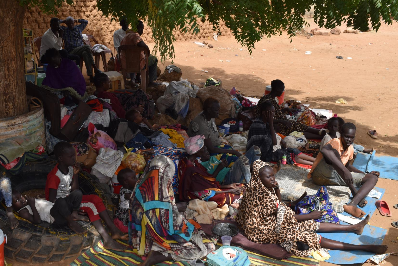
UNHCR conducted a needs assessment among refugees from Khartoum arriving in White Nile State with a view to inform interventions targeting groups at heightened risk including women and children.