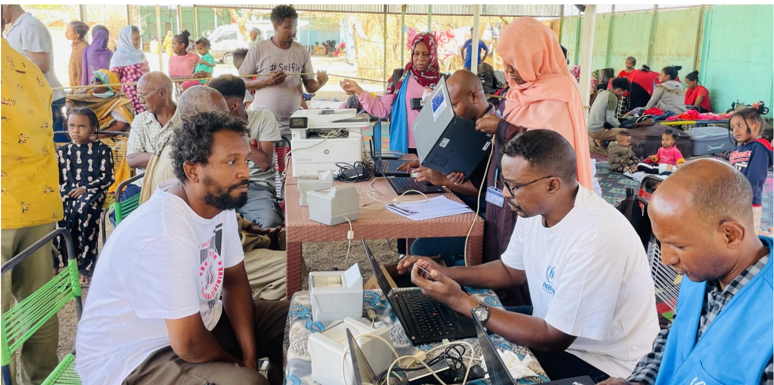
Refugees and asylum seekers who fled to Um Gulja in Gedaref state are undergoing joint registration by UNHCR and the Commission for Refugees for their onward relocation to the camps.

Protection monitoring. Where security and mobility allow, UNHCR teams conduct visits to refugee and IDP hosting areas, including the new sites in Port Sudan, East Sudan States and White Nile State. The Office consults communities with a view to get in-person feedback on ongoing protection risks and challenges in accessing services in close coordination with partners. Protections monitoring through community networks remains active through various activities in East Sudan and White Nile State. In locations affected by conflict, community volunteers who remain in those locations continue to be in touch with UNHCR via phone to report on the situation on the ground. Community outreach volunteers have been active in those areas, identifying protection issues, critical humanitarian and protection needs, challenges in accessing services and reporting on them with a view to help target the response. Where the security situation does not allow, UNHCR tries to maintain contacts with authorities and other key informants, amidst challenges in communication and connectivity.