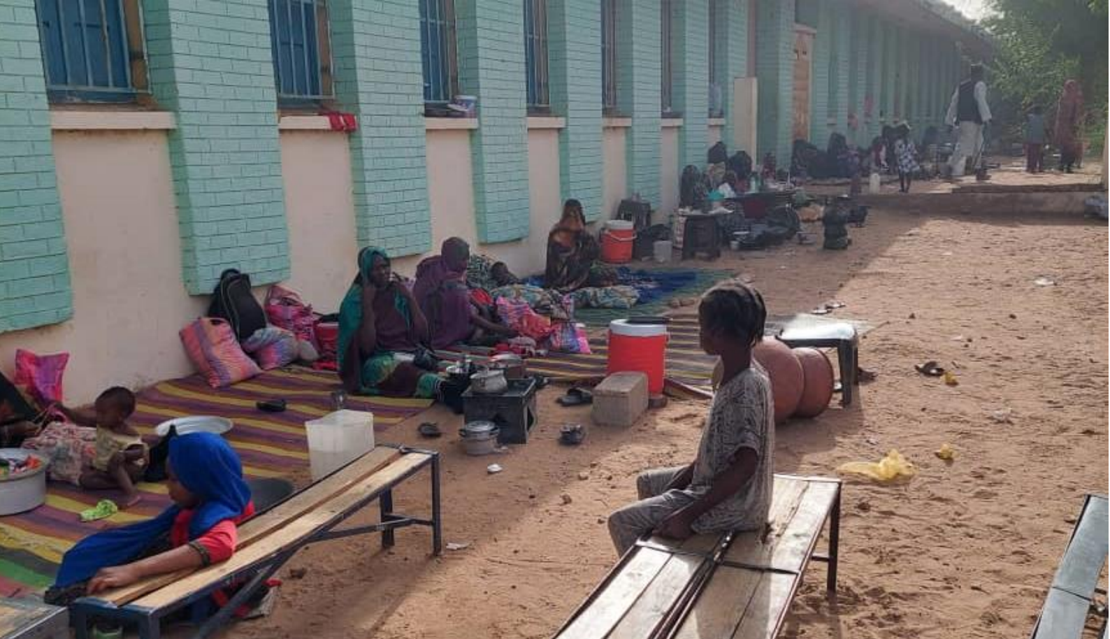
As the security situation allows, UNHCR strives to undertake protection monitoring to inform future interventions. The first such exercise in the Darfur region took place on 24-25 May in Nyala, South Darfur. Across Darfur, multiple sites are reportedly in extremely poor conditions, leading to increased vulnerabilities among the displaced population including women and children.

Deprivation and destitution are compelling families to resort to harmful coping mechanisms, including selling of assets and properties, but also more pernicious strategies such as child labour, sell and exchange of sex, and other forms of exploitative labour, heightening protection risks that remain unmitigated. Even when the security situation allows families to flee to safer areas within the country or to neighbouring countries, their arrival puts an unsustainable pressure on assistance and services at destination, in areas where humanitarian needs were already high. UNHCR's scale up of infrastructures, assistance, and protection programs in refugee sites in the East and in the South of Sudan, often cannot keep up with the fast rate of arrivals. In recent days, food distributions in the East have not been able to cover all needs of all refugee population since the list of beneficiaries was still pre-dating the eruption of the conflict.