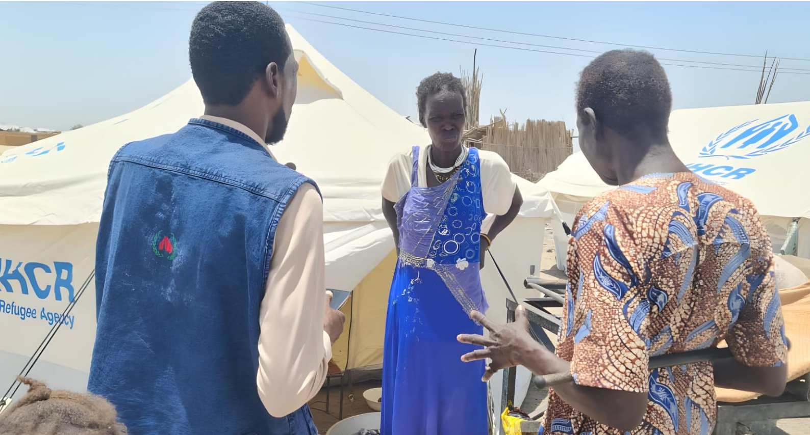
An interagency needs assessment initiated by UNHCR was conducted among refugees arriving from Khartoum and other unsafe areas in White Nile State.

The conflict between SAF and RSF has also triggered intensified intercommunal conflict in certain parts of the country, particularly in West Darfur. This has caused the displacement of at least 250,000 individuals 4 including and devastating effects on the availability of health services, markets, food, water supply and electricity 5 including due to the forced suspension of numerous humanitarian programs addressed to both IDPs and refugees.