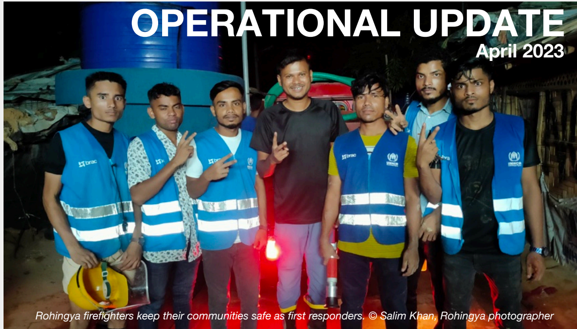
Rohingya firefighters keep their communities safe as first responders.