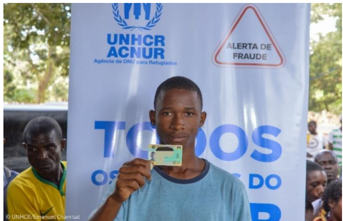
National ID card delivery ceremony in Namialo District, Nampula Province.