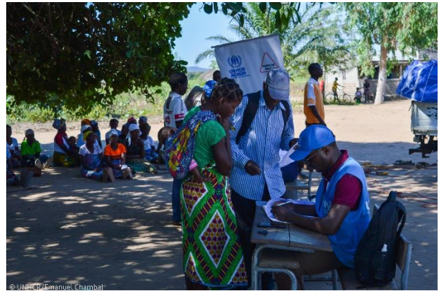
CRI distribution in Zambezia Province.