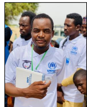
President of the DAFI Club