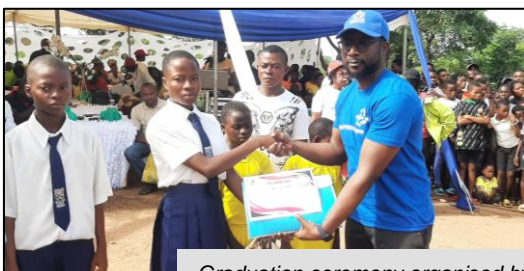
Graduation ceremony organised by UNHCR Nigeria

In Nigeria , educational activities such as inter-school debating and spelling competitions , awareness raising on the importance of education, playlets , news broadcasts and an art competition were carried out in three states (Benue, Cross, River and Taraba)