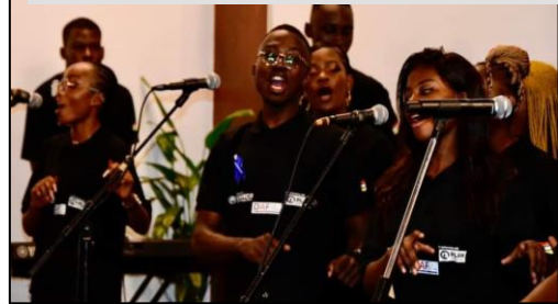
DAFI choir performance at the WRD ceremony in Yaounde

In Cameroon , under the patronage of the First Lady, Madam Chantal Biya, young students and alumni of the DAFI scholarship programme have carried out several activities: environmental campaigns to clean up public spaces, a sports walk to promote peaceful coexistence and social integration of refugees in their host communities, a health campaign to prevent cardiovascular diseases, and a musical performance by the DAFI student choir. More than 150 DAFI students and alumni actively participated in the various activities organised in the cities of Yaoundé, Douala and Ngaoundéré. These activities benefited young people by contributing to strengthening social cohesion and local integration.