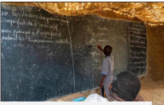
Nigerian refugee and host community children at a UNHCR-supported school in Madaoua.

Since 2021, 36,000 Nigerian refugees have fled to the Bangui district of the Tahoua region due to attacks by non-state armed groups .