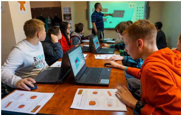
Resilience Innovation Facility Centre - Brasov

Since the beginning of the international conflict in 2022, Terre des hommes (Tdh) Romania has responded to the immediate needs of children, young people and mothers arriving in Romania, providing essential support in areas such as protection, mental health, psycho-social support, or personalized individual assistance.