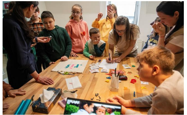
Resilience Innovation Facility Centre - Bucharest