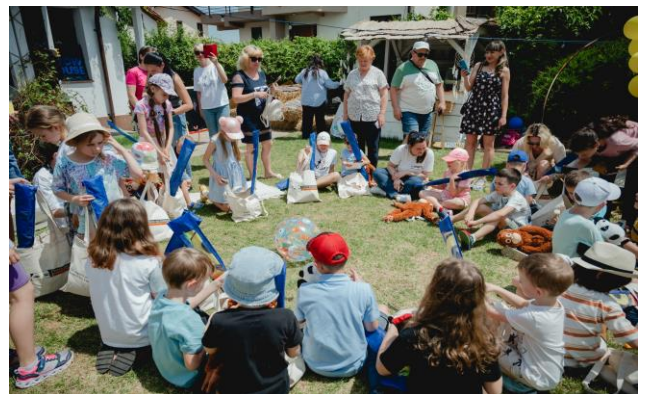
Children's Day – Bucharest