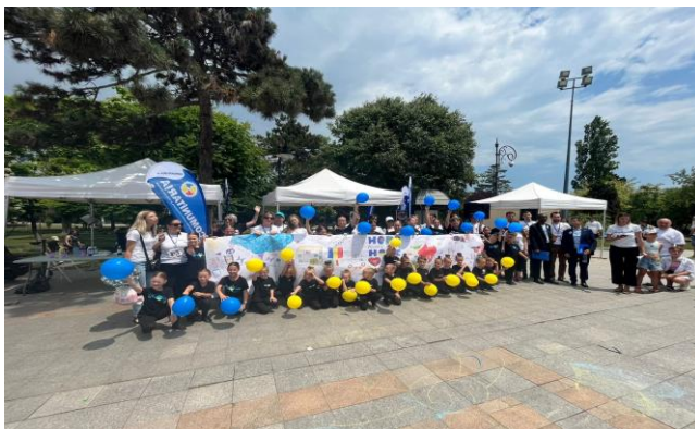
World Refugee Day - Constanta