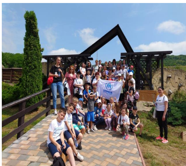
World Refugee Day in Iasi

UNHCR and partners commemorated the World Refugee Day with a series of events with participation of relevant authorities and institutions at national and local level, media, humanitarian actors and refugees from Ukraine and around the world hosted in Romania. Throughout the week, hundreds of refugees in Timisoara, Bucharest, Suceava, Galati, Constanta, Iasi, Radauti, and Sibiu engaged in the activities and exchanged their experiences. All events and engagements were centered around this year's theme Hope Away from Home – a world where refugees are always included, and highlighted the solidarity that refugees receive in Romania.