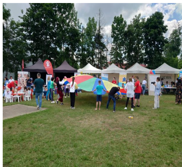
World Refugee Day in Suceava

In order to better target assistance to those that are most in need, RRP partners, under the Protection, Basic Needs and Cash Working Group, together with the municipalities of Bucharest and Brasov developed a new, inter-agency and inter-sectoral vulnerability targeting methodology. On 16 June, the Municipality of Brasov and the Inter-Agency coordination platform, led by UNHCR, organized a workshop to discuss the vulnerability assessment scorecard methodology that has been developed in consultation with protection agencies and actors providing cash and other critical humanitarian assistance. 28 participants from 17 partners, including municipalities, UN Agencies and NGOs participated and discussed the vulnerability criteria for assistance. The resulting scorecard is being rolled out in the 'cash for protection' program of UNHCR in July and agencies interested in piloting the scorecard in their programs can contact the inter-agency team (contact details below).