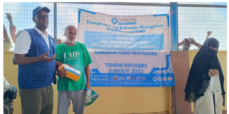
Distribution of food in Markazi by the NGO HHRD

The international charitable NGO "Helping Hands for Relief and Development" distributed 800 food baskets on the Markazi site for the two communities, Yemeni refugees, and Eritrean asylum seekers, as part of the food distribution on the blessed month of Ramadan.