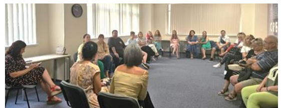
Workshop on "the rights and obligations at the workplace" organized by AFF on 10 August.

UNHCR continues supporting refugees prepare for employment opportunities in Romania. On 10 August, UNHCR Partner Ateliere Fara Frontiere (AFF) organised a workshop on "the rights and obligations at the workplace", with 26 refugees from Ukraine. From 7 to 11 August, partner HEKS EPER organised a five-day intensive vocational manicure course for refugees from Ukraine in Cluj. HEKS EPER also provide support and grants to refugee job seekers interested in opening their own business. Last week, a grant was given to a refugee starting-up her own hair salon. So far in 2023, more than 3,700 refugees have received employment related services from UNHCR and partners.