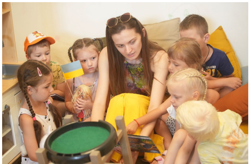
Refugee children from Ukraine in the summer camp organized by UNHCR at the Budapest Helps! Community Center, which is jointly run with the Budapest Municipality and IOM.

1 Multi-country office in Budapest, also supporting national offices in the Czech Republic, Slovakia and Slovenia.